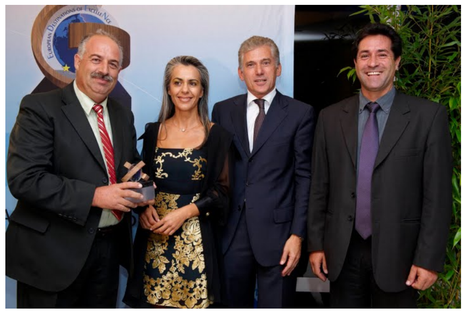
PressRelease 2\_EDEN~III\_MKazepiCTO~Awards ETF 2009~www\_EN